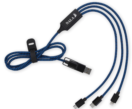
32408 | Good Value™ All-Over Charging Cable 2A Equipped with multiple connectors, this charging cable is ideal for emergency management agencies to distribute during disaster preparedness campaigns, ensuring residents can keep devices powered during natural disasters.