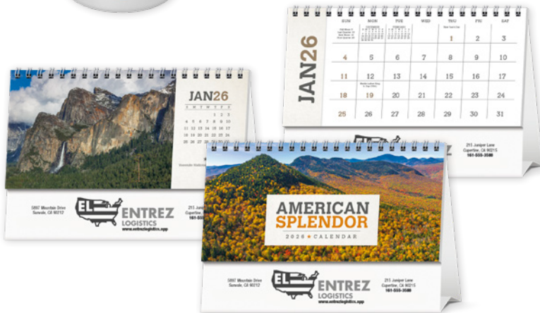
4251 | Triumph® Calendars American Splendor Desk Calendar With photographs of beautiful locations from across America, this compact desk calendar supplies inspiration while acting as a quick planning tool for busy civil servants.