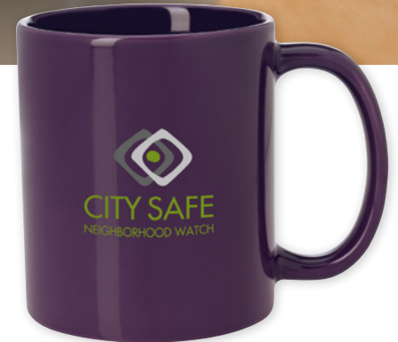
45140C | Good Value™ Budget Mug - 11 oz. (Colors) This classic ceramic mug, available in multiple colors, is perfect for office break rooms, providing staff with a durable, reusable option for their daily hot beverages.

Featuring double-wall vacuum insulation and a press-in lid, this stainless steel tumbler is ideal for field officers in environmental agencies, keeping beverages at the desired temperature during outdoor assignments.