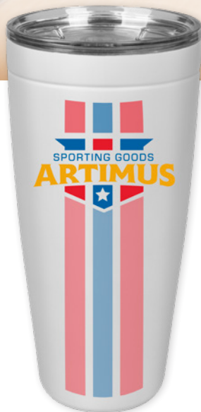
CDKW038 | The Viking Collection® Nova Tumbler - 20 oz.

Featuring double-wall vacuum insulation and a press-in lid, this stainless steel tumbler is ideal for field officers in environmental agencies, keeping beverages at the desired temperature during outdoor assignments.