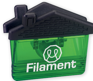
30357 | Good Value™ House Clip Share this magnetic house-shaped clip with clients to keep claim documents, reminders, or paperwork organized and accessible.