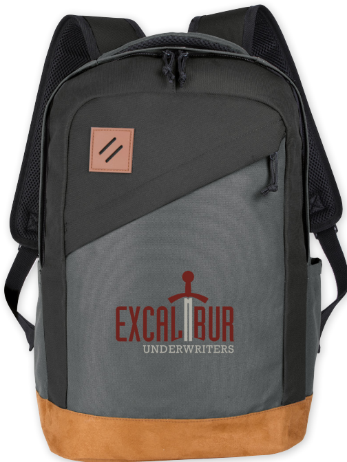
16193 | KAPSTON® Willow RPET Backpack Reward loyal clients or new hires with this suede-trimmed backpack made from 71% post-consumer recycled PET, underscoring your company's commitment to sustainability.